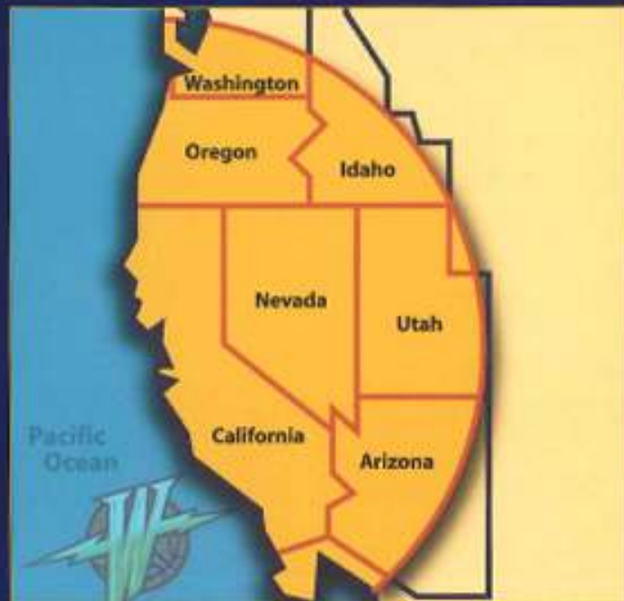
KNBR COVERAGE MAP