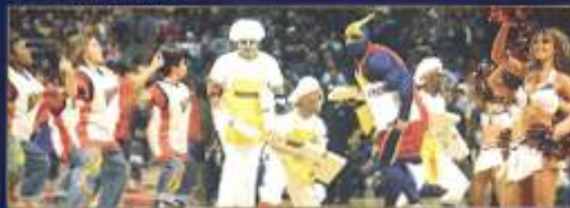
GREAT TIME OUT ENTERTAINMENT