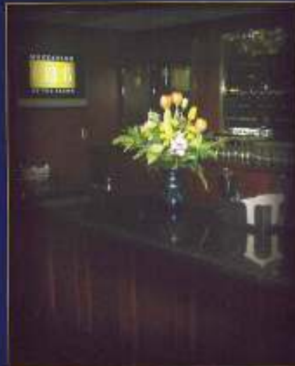
MEZZANINE CLUB SUITE