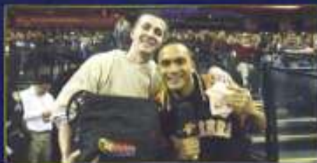
ON COURT CONTEST