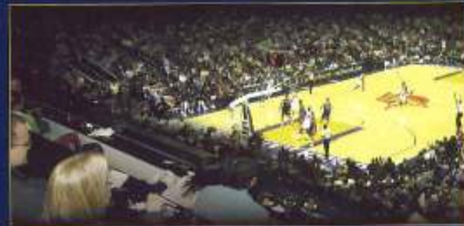
PREMIUM ENTERTAINMENT PARTY SUITE (50 GUESTS)