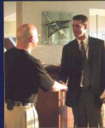
WARRIORS CORPORATE SUITE "THE WARROOM"