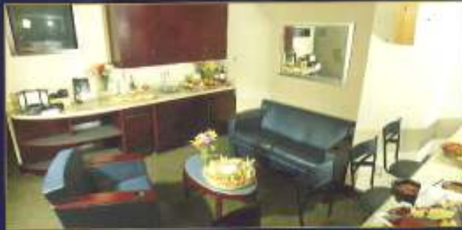
VIP LUXURY SUITES (16 GUESTS)

The Warriors understand the need to provide our valued clients with the very best in hospitality and entertainment experiences. Whether entertaining one or 100 guests, the Golden State Warriors can provide clients with a variety of hospitality elements designed to create valuable business networking opportunities in a high-profile, high-excitement setting. Hospitality elements to include: