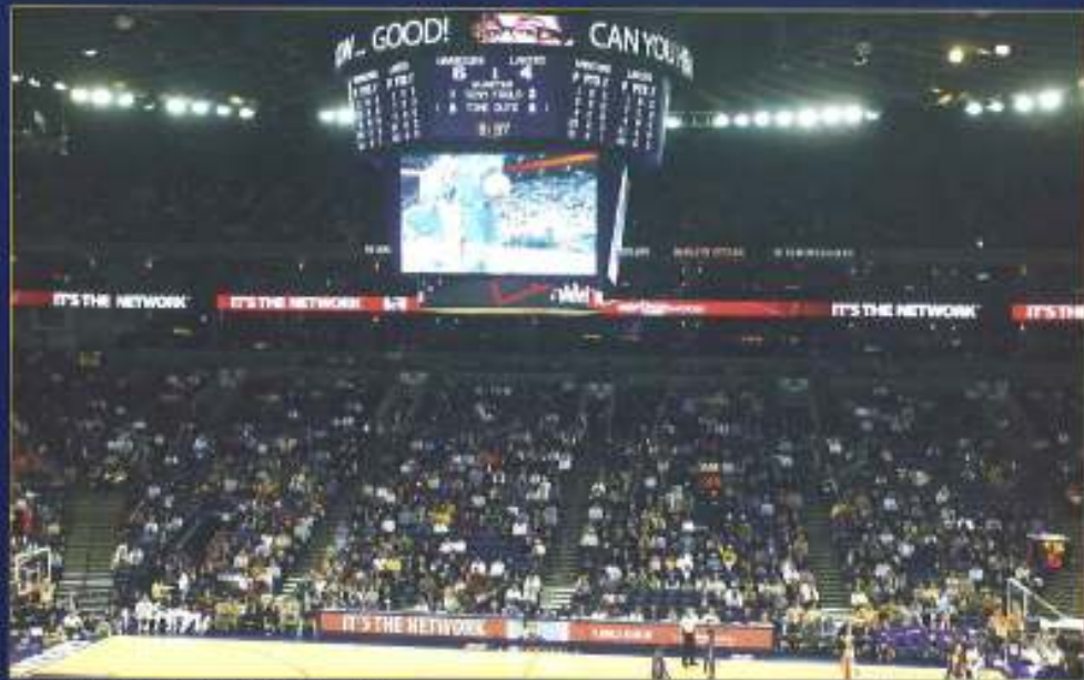
360 LED SCOREBOARD & PRESS TABLE

Premium signage opportunities include LED Digital Signage Technology along with Rotating Press Table signage, providing the most dynamic visual brand presence in all of professional sports. Dynamic branding opportunities include premium club branding of ORACLE Arena's sideline and courtside club areas, catering to upscale clientele in a unique, entertainment setting.